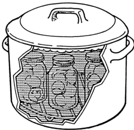
Water Bath Canner

Jar lids need to be prepared as instructed by the manufacturer ahead of filling time. Read the manufacturer's instructions on preparing and attaching lids. Instructions will not be the same for all lid types. With two-piece metal canning lids, the flat lid should be used only once for sealing new products, but the ring bands can be reused as long as they are in good condition. Ring bands should be free of rust and not bent out of shape. Flat lids should be free of dents, scratches and gaps or flaws in the sealing compound. Do not reuse lids from commercially canned foods for home canning.